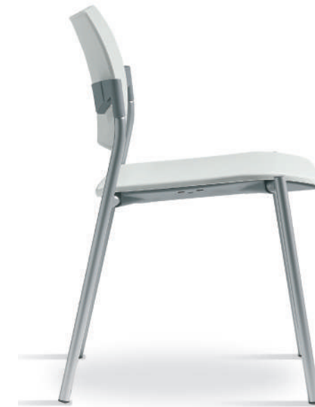
DREAM COMMUNITY CHAIR