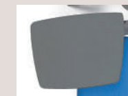
Tavoletta scrittoio. Writing table.